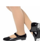
Black Tap Shoe