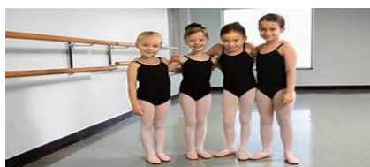
Combo I (Skirt Optional)