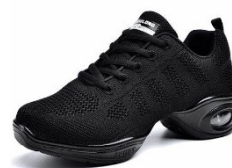
Hip Hop Sneaker