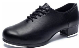
Black Oxford Tap