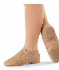
Tan Jazz Shoe