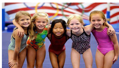
Acrobatic Tumble (No Shoes)