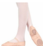
Pink Split sole Ballets