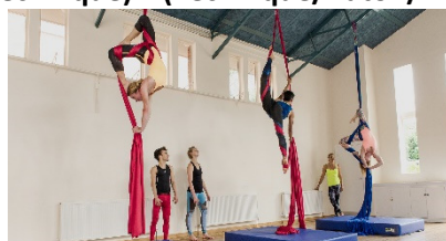
Aerial Silks - Form Fitted Clothing (No Shoes)