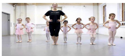
Itty Bitty, PreDance, PreCombo (Skirt Optional)