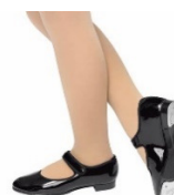
Black Tap Shoe